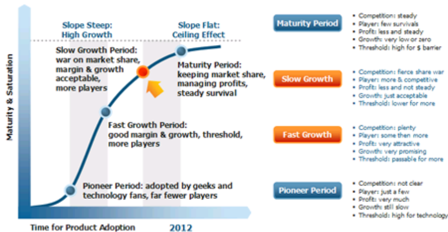
Figure 1: Product Lifecycle

While the industry has been talking about the digital home for many years, it will finally take the first step this year with the transition to digital signal broadcasting—opening the doors for new applications such as IPTV broadcasting, home broadband platforms and more.